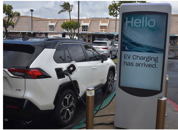
Growth in Number of Electric Vehicles