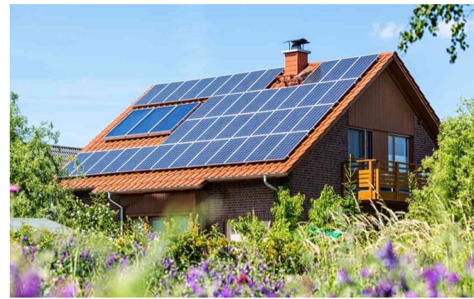
Volatile Energy Markets / Lowering Cost of Renewables